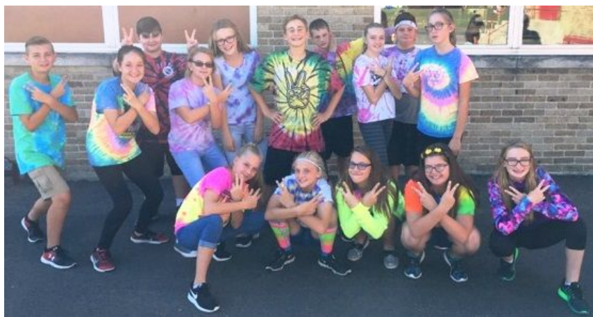
7th graders show their school spirit on Tie Dye day.